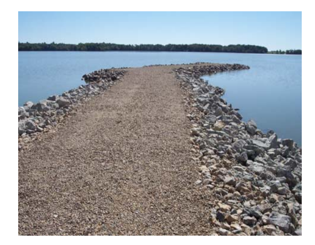
New Fishing Jetty at Silver Lake (funded with fish habitat stamp monies)