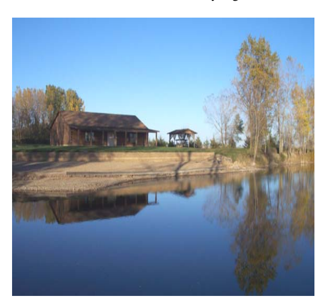
Shelter at Kuennens Quarry

On August 26, 1958 the Worth County Conservation Board held is first monthly meeting. The Board meets on the first Thursday of every month at 7 PM at the conservation board office. The meetings are open to the public. The office is located at 503 1st Ave N in Northwood. The phone number is 641-324-1524 and e-mail address is wccb@worthcounty.org.