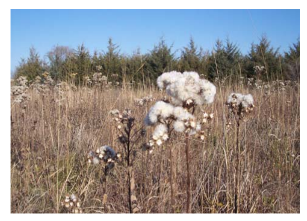
Habitat at Land of Two Waters